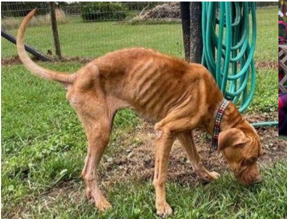
An Incredible Transformation

Sweet Potato is but one example of bringing a dog in from Animal Services. She just needed love and care. Look how beautiful she was in her adoption photo. One week before Christmas she went home. She's now named Honey and is absolutely adored.